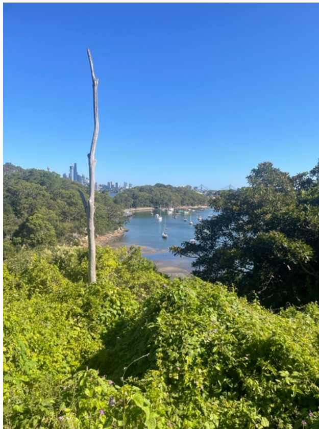
Scenic view over Gore Park Reserve and Berry Island. Short walk.

MAY: Rose Bay Hermitage Walk to Nielsen Park. + Extension.